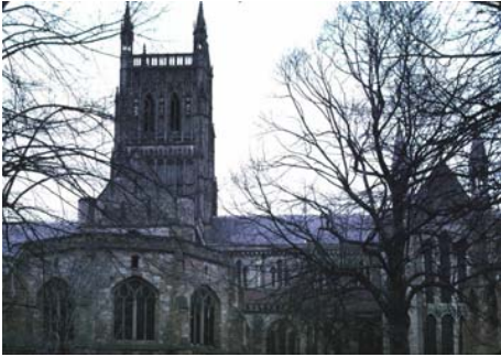
Worcester Cathedral, 2002

Lighting potential 5.5 tonnes CO 2 per year & £5.7k